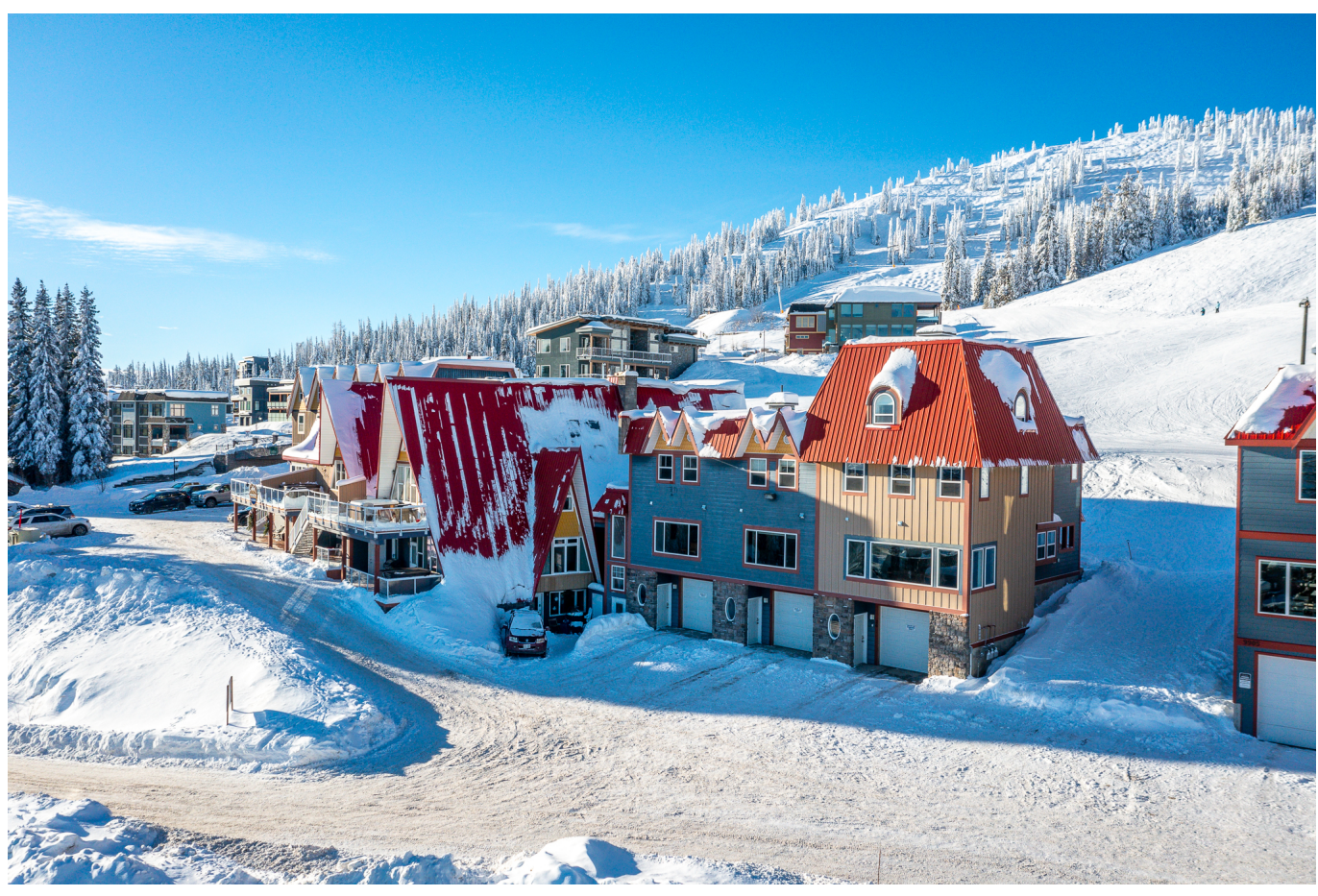
Turnkey Ski In - Ski Out location near Village Center!

Located in a boutique complex with a prime ski-in/ski-out location near the village center. This turn-key, spacious 1,000 sq. ft. 2-bedroom, 2-bathroom townhouse suite offers year-round comfort and style. Showcasing neutral, modern decor, the home features a private hot tub overlooking the ski run—perfect for unwinding after a day on the slopes. Recent upgrades by Land Construction include a revitalized hot tub and patio area, a cozy gas fireplace, and new flooring. Additional amenities include a large owner's ski/bike locker, on-site rental management, a common wax area, and convenient parking. This property offers exceptional value and excellent income potential in both winter and summer!